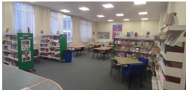
2 - New Books for the New School Year

I very much look forward to welcoming both our new and returning pupils.