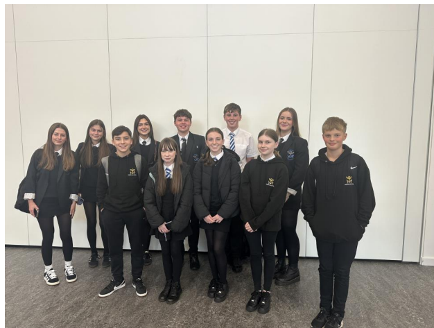
Midlothian's Secondary Learners' Conference