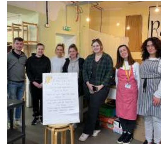
Morrison Construction Volunteering Day at Penicuik Storehouse