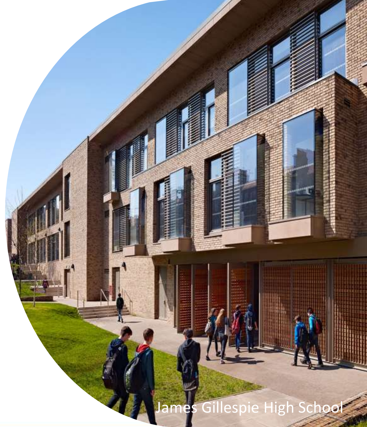
James Gillespie High School