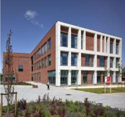
Castlebrae High School