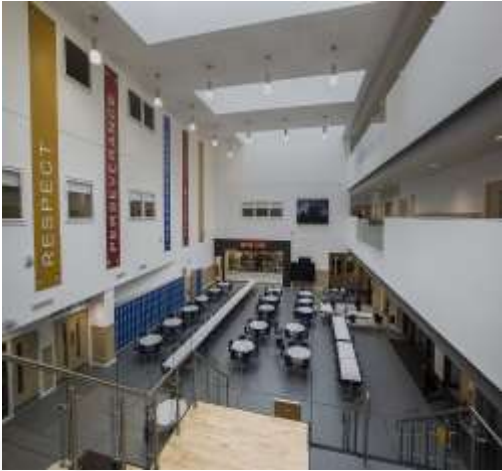
Newbattle High School