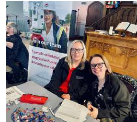
Morrison Construction team attending a careers event in Dalkeith