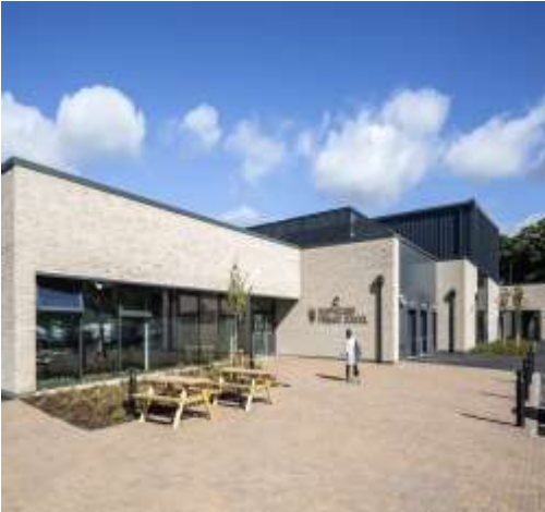
Easthouses Primary School