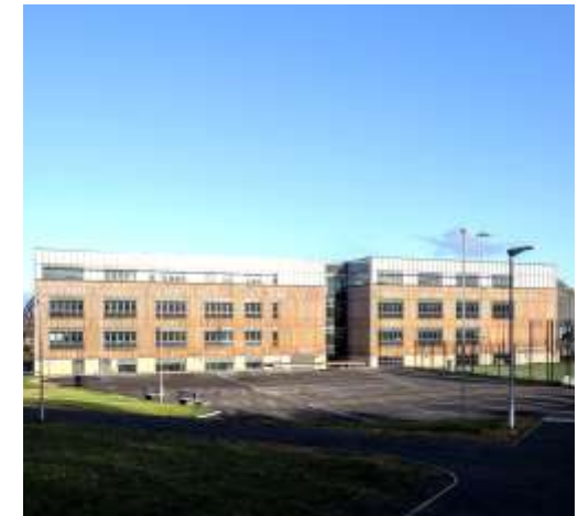
Queensferry High School

The Morrison Construction team are highly experienced in the safe delivery of 'tandem build' education projects – where an existing school building remains occupied during construction of the new building.