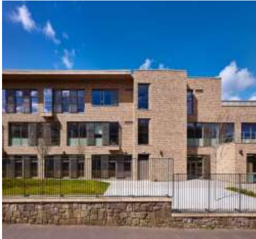
James Gillespie High School