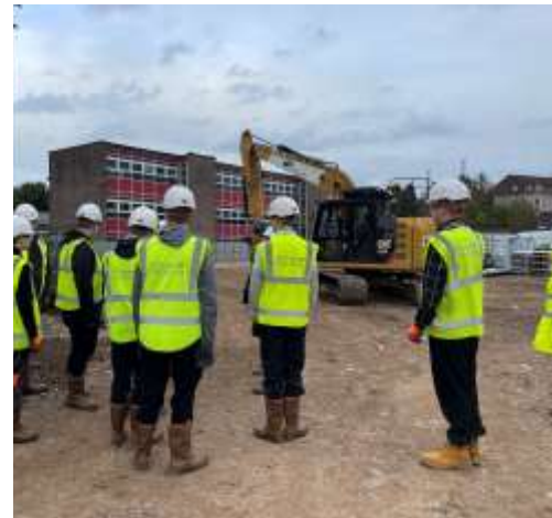
Faifley Campus 'So, You Want to Work in Construction?'